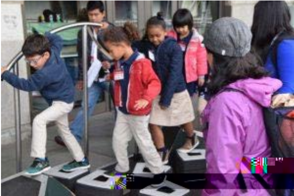
WCMS students at the Exploratorium, November 2017