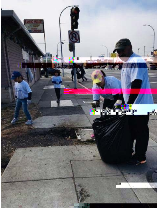
West County Mandarin School families participating in the 23 rd Street Community Clean Up this past October.